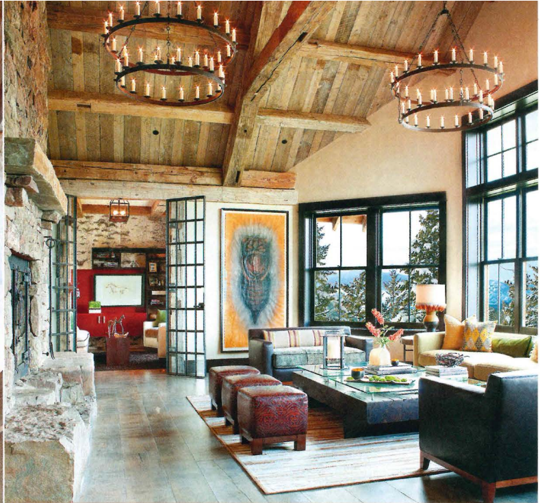
ABOVE: The home relies on typical Western materials, applied in both conventional and uncommon ways. The double-sided fireplace is made of Harlowton Stone from Montana. LEFT: The lounge takes the place of a formal dining room, which the owners felt they'd rarely use. The square iron tables were built by Custom II Manufacturing in Bozeman. BELOW: Embodying the home's rustic-contemporary vibe, the chainmail chandelier was custom-made by CP Lighting in Milwaukee.