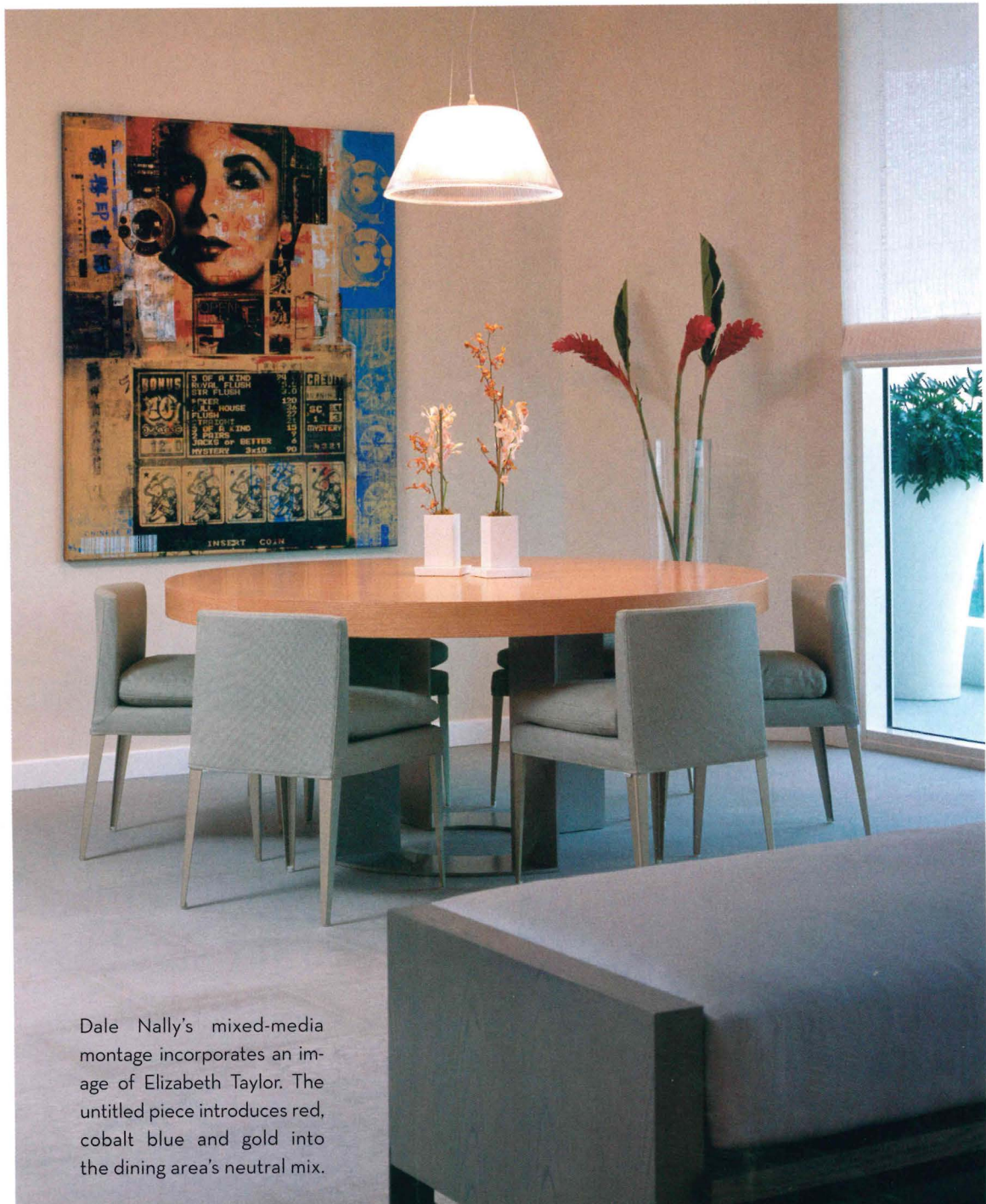
Dale Nally's mixed-media montage incorporates an image of Elizabeth Taylor. The untitled piece introduces red, cobalt blue and gold into the dining area's neutral mix.

Throughout, Kanning layers a sophisticated palette of neutrals with subtle variations of sage green and pale blue. Gray limestone flooring